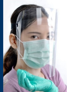
FDA approved plastic film