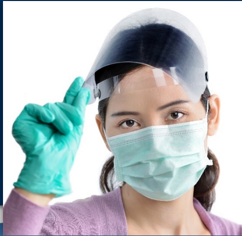
Visor can be tilted upwards