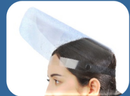
Tilt and hold