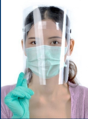
Light weight, Airy & Odourless