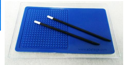
Covered with clear plastic box